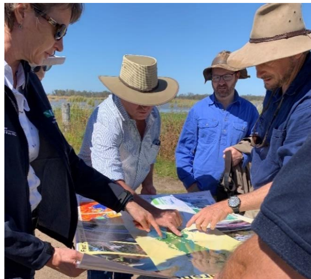
Macquarie Marshes field visit

Planning for the delivery of water for the environment has been undertaken by CEWO, NSW Department of Planning, Industry and Environment and NSW Department of Primary Industries - Fisheries in consultation with the Macquarie Cudgegong Environmental Flow Reference Group. This group includes representatives from local landholders, irrigation, environment groups and the Aboriginal community.