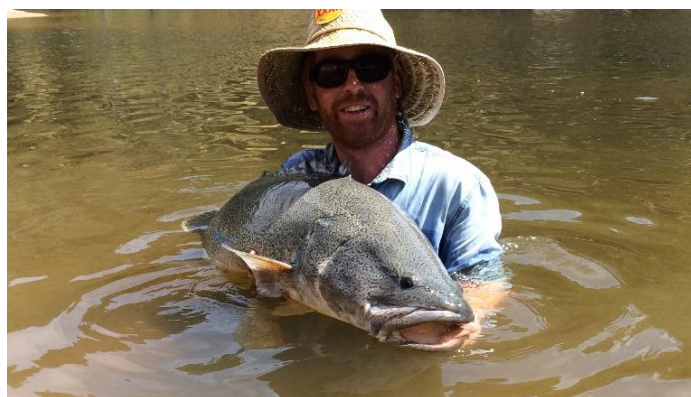
Murray cod, Macquarie River

These flows aim to support Murray cod nesting and provide breeding opportunities for other native fish such as carp gudgeon and un-specked hardyhead. Ensuring nests are not exposed or disrupted is important for successful nesting.