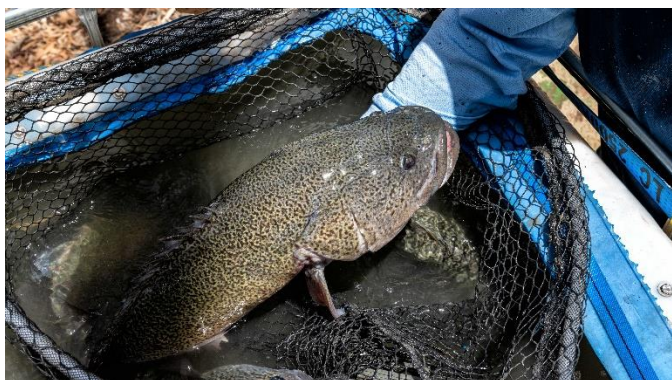
Rescued Murray cod (NSW DPI-Fisheries)

Populations of Murray cod in the Macquarie valley have been impacted by water resource development, loss of habitat and the presence of barriers. Extremely dry conditions led to devastating fish death events in the Macquarie River earlier this year. Importantly last summer, passionate locals and NSW DPI Fisheries rescued and relocated hundreds of native fish including Murray cod to safer waterholes in the Macquarie River.