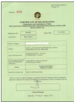
Figure 5: Certificate of Registration