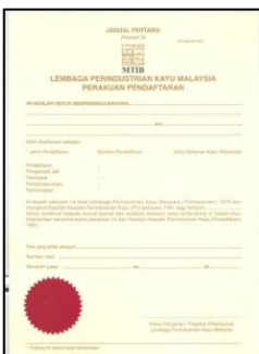
Figure 1: Registration Certificate