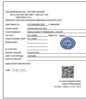
Figure 7: Export Licence (Back Page)