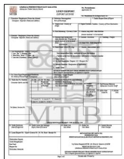
Figure 2: Export Licence