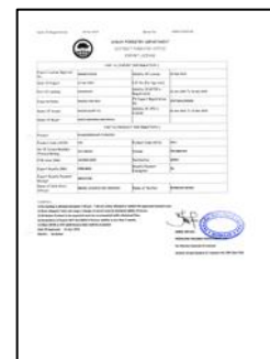
Figure 4: Export Licence