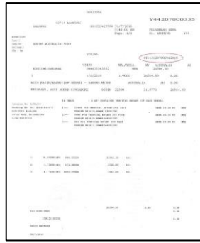
Figure 6: Export Licence (Front Page)