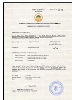
Figure 3: Exporter Registration Certificate