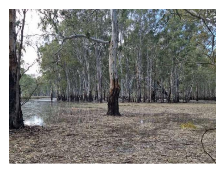
© Sonia Cooper, 29 July 2021. On Barmah Lake.

When environmental flows are released following a flood, the flows help consolidate the benefits from the higher natural flows. For example, keeping some water in the core wetlands helps improve the health of vegetation and allows waterbirds to complete breeding cycles.