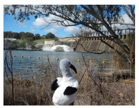
Flo, the Murray Wetland Flow mascot, watching water being released from Hume Dam for Barmah-Millewa Forest

This year, the Murray Wetland Flow has a mascot – an Australian white ibis named Flo. She represents one of the species of waterbirds that the flow aims to help by providing places to feed, nest and breed.