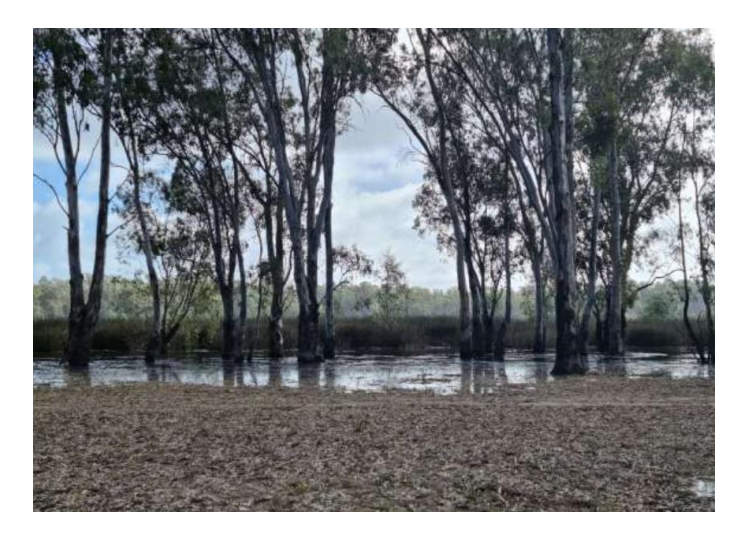
© Sonia Cooper, 29 July 2021, Barmah Lakes wetland system starting to fill.