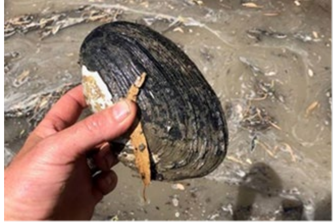
A mussel found in the Mehi River, Gwydir catchment (8 November 2020).

Recently, when flows returned to part of the Gwydir system, mussels were seen to be re-emerging as the water arrived. With the release of the Northern Waterhole Top-up, we hope to see more mussels emerging from the bed of the Barwon River in coming weeks!