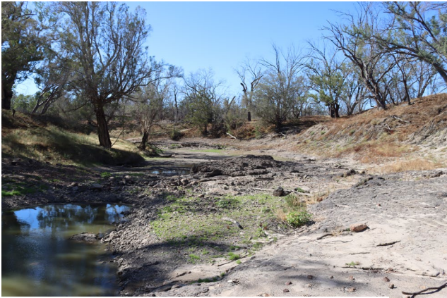
Calmundi weir pool (December 2020).

Whilst our monitoring has shown that dissolved oxygen in waterholes is currently at reasonable levels, it is declining and can change quickly. Our aim is to add a little extra water to the waterholes so they are more prepared for the coming very hot weather.