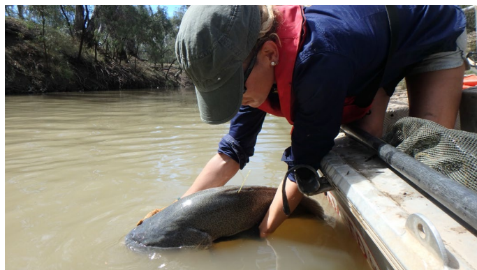
Releasing a tagged Murray cod.

Through summer, if the waterholes remain stagnant, the native fish living in them (including Murray cod) may struggle to survive.