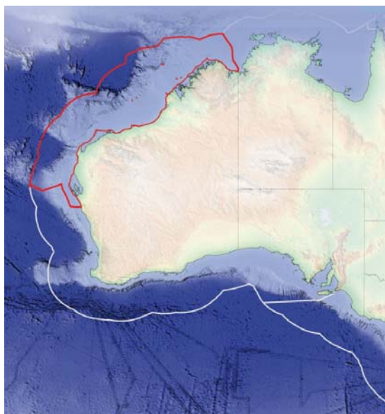
Figure 2: Map showing the boundaries of the North West Marine Region

The development of the North West Marine Bioregional Plan involves the following four planning stages: