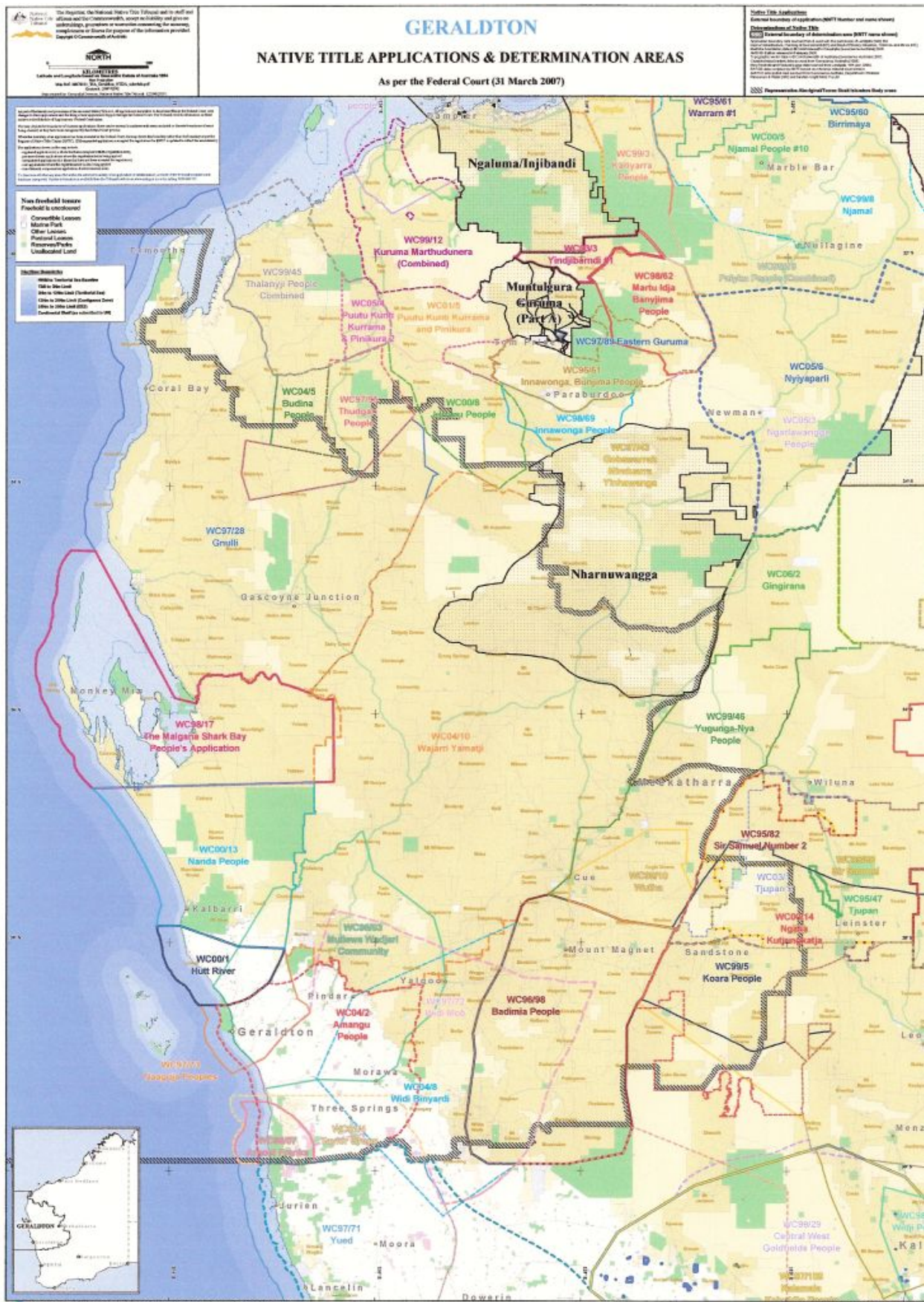
Figure 4: Native title claims in the Geraldton region