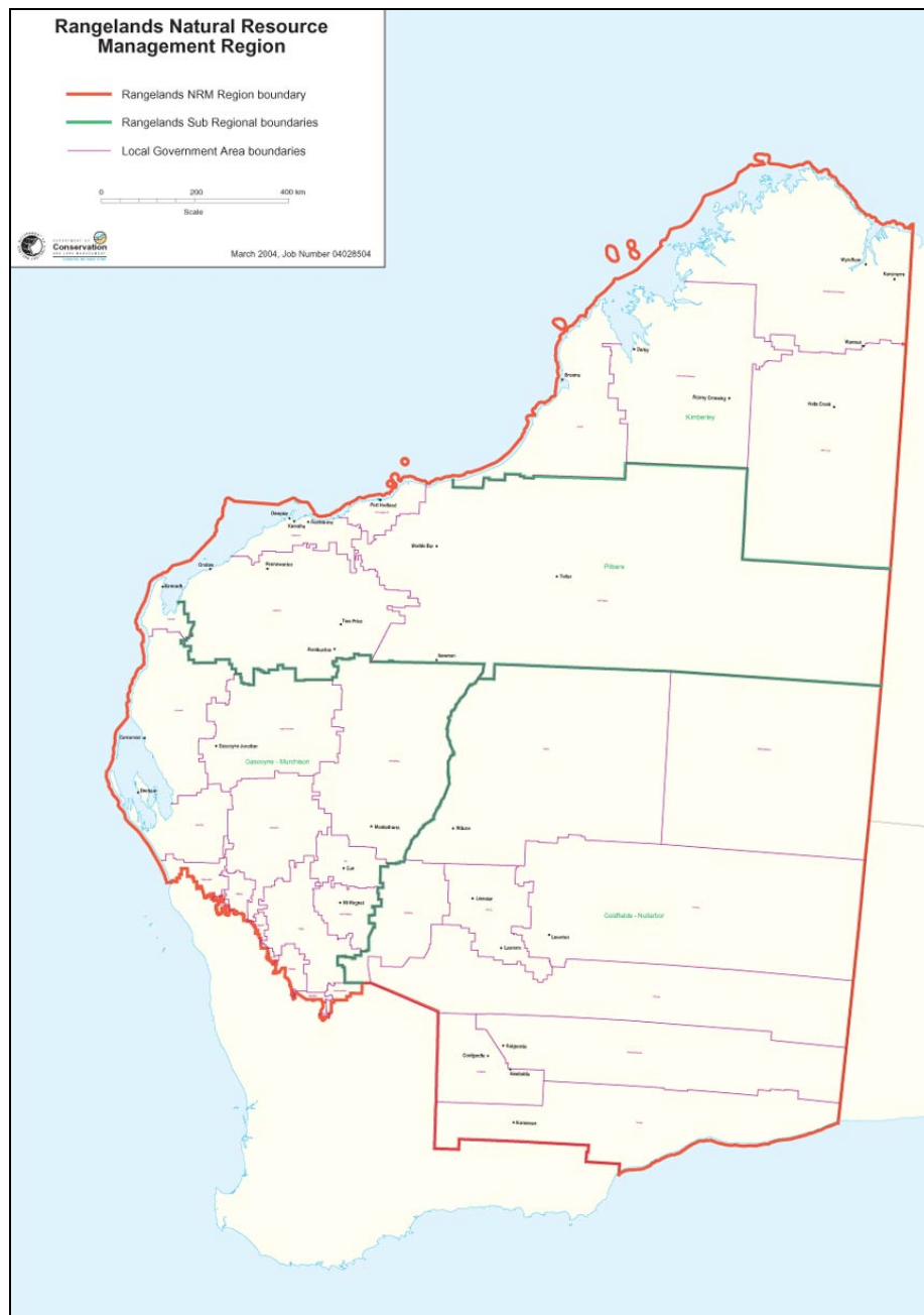
Figure 7: Map of Rangelands NRM Region