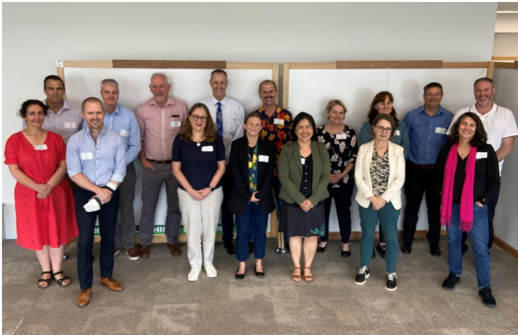
PHC64 members and attendees

The PHC evaluated and endorsed the prioritised list of fruit fly diagnostic projects provided by the Australian Fruit Fly Technical Advisory Committee and the Subcommittee of Plant Health Diagnostics. This will help to integrate new technologies and techniques, higher-definition images, and diagnostic resources and protocols available to fruit fly diagnosticians.