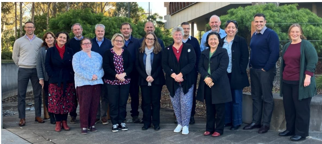
PHC65 group photo (PHC members and observers)