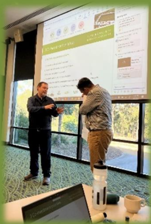
Photo: PHC members in workshop

PHC also approved the Asiatic citrus psyllid as a target for biological control, in accordance with Revised guidelines for the introduction of exotic biological control agents for the control of weeds and plant pests . It was noted that as it can take a while to compile the required research and data to support biological control assessments the sooner this is (pre-emptively) commenced the better. Members and observers commended industry for their focus on preparedness in this context.