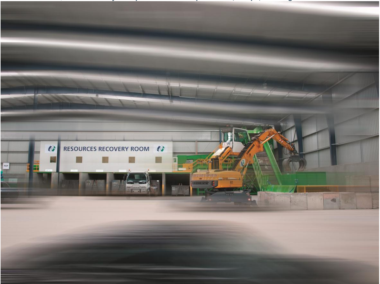
Figure 6-3 Adelaide's largest recycling facility, commissioned by Integrated Waste Services (IWS) and the Southern Region Waste Resource Authority (SRWRA) in response to the impending landfill bans. The $4 million facility will open late 2012 and process 50,000 tpa, diverting 75% from landfill