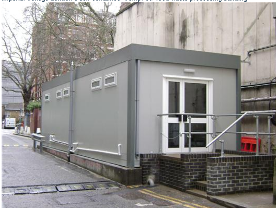
Figure 5-2 Imperial College London's self-contained 'CompPod' food waste processing building

More than 1 tonne of food waste is now composted on site every week, originating mainly from the campus dining halls and cafes. 12