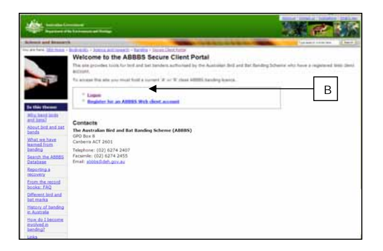
Fig 2: The Australian Bird and Bat Banding Scheme secure client web portal 'Welcome' screen

4. The ABBBS secure client portal screen is displayed. You can then select the 'Logon' hyperlink (B) as shown in Figure 2.