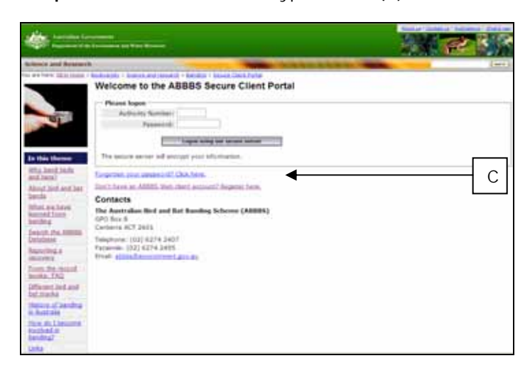
Fig 3: The Australian Bird and Bat Banding Scheme secure client web portal – logon screen