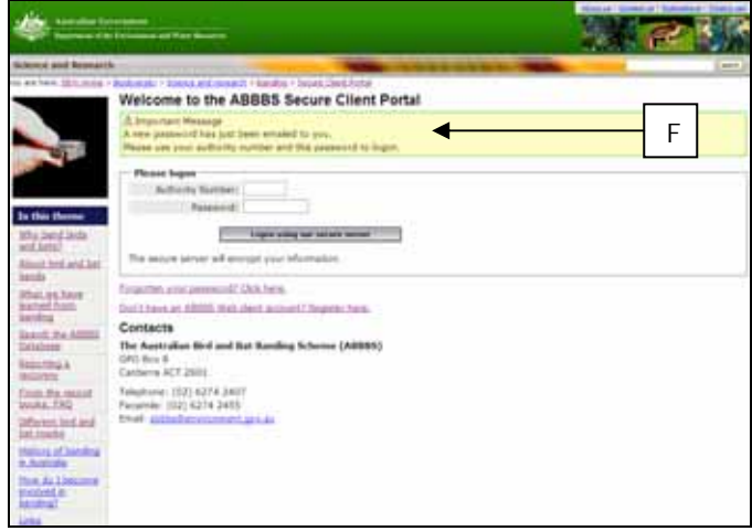
Fig 5: The Australian Bird and Bat Banding Scheme secure client web portal – logon screen

10. A message will be displayed on the refreshed page at (F) that will let you know that your password has been re-set and your new password has been emailed to you.