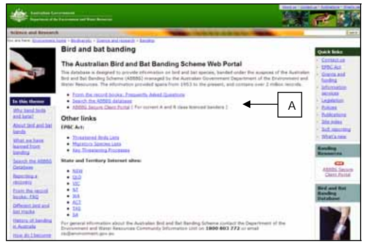
Fig 1: The Australian Bird and Bat Banding Scheme web portal

4. The ABBBS secure client portal screen is displayed. You can then select the 'Logon' hyperlink (B) as shown in Figure 2.