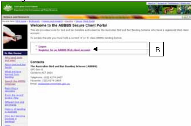
Fig 2: The Australian Bird and Bat Banding Scheme web portal – welcome screen