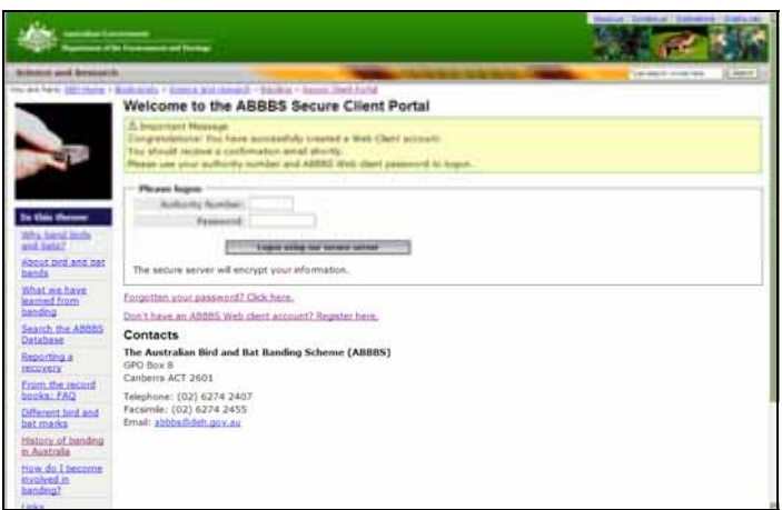
Fig 4: The Australian Bird and Bat Banding Scheme web portal – logon screen