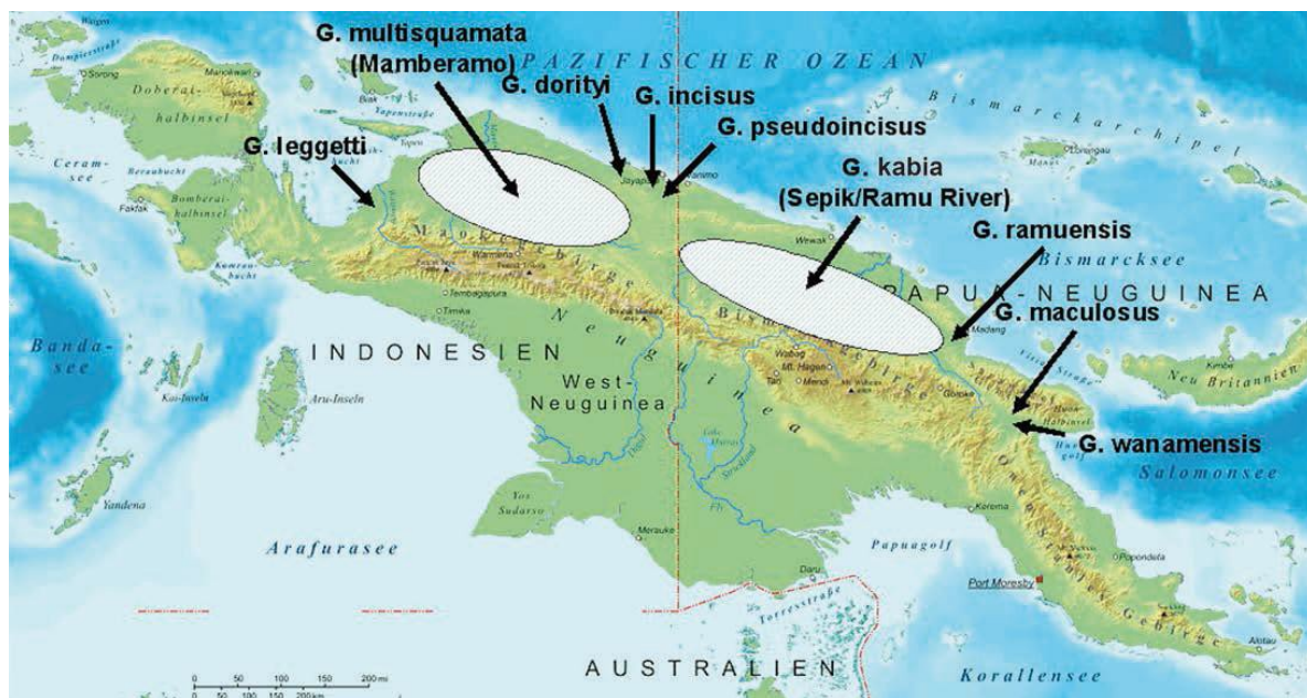
Fig. 1: Distribution of the genus Glossolepis . Map: Creative commons, modified.