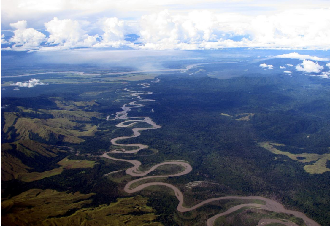
Ramu River

Froese, R. and D. Pauly. Editors. 2020. FishBase. www.fishbase.org , version (12/2020). https://www.fishbase.in/summary/Glossolepis-ramuensis.html