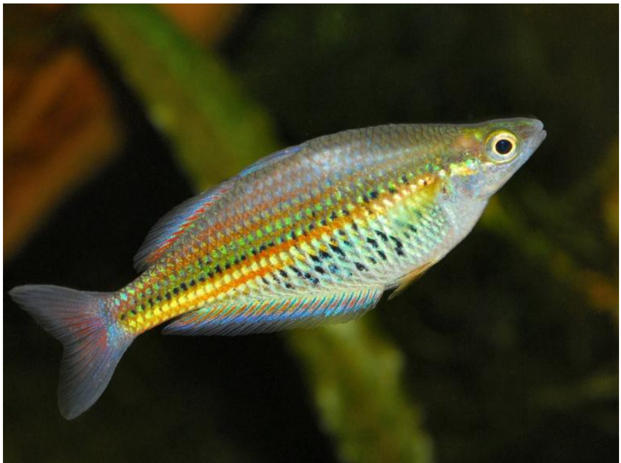
Glossolepis ramuensis

Allen, G.R. 1985. Three new rainbowfishes (Melanotaeniidae) from Irian Jaya and Papua New Guinea. Revue française d'Aquariologie Herpétologie 12(2): 53-62.