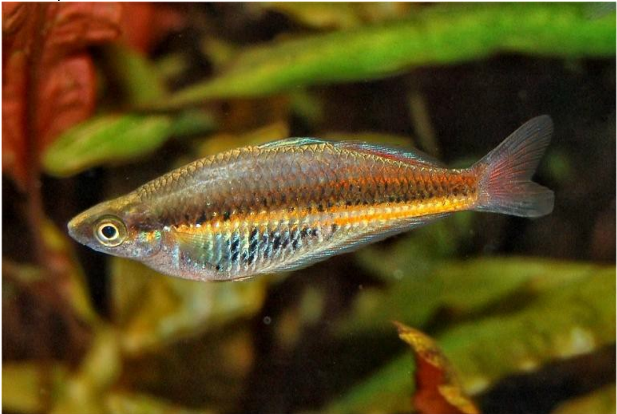
Photograph - © C. Mailliet, permission to use image obtained 17 March 2021