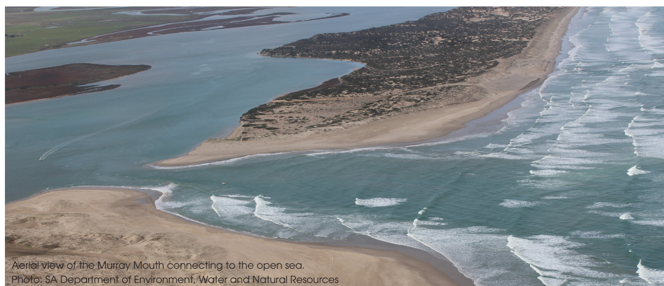
Aerial view of the Murray Mouth connecting to the open sea.

Australia reported the changing ecological character of the Coorong in December 2006. Commonwealth environmental water, through the Basin Plan, is one strategy used to help sustain the wetland and ensure Australia meets its international obligation to protect the wetland.