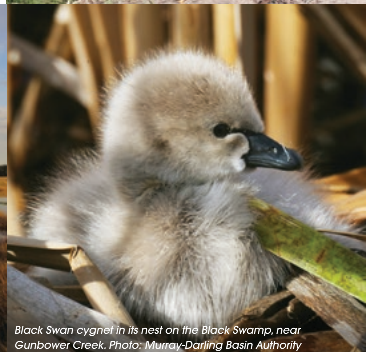
Black Swan cygnet in its nest on the Black Swamp, near Gunbower Creek.