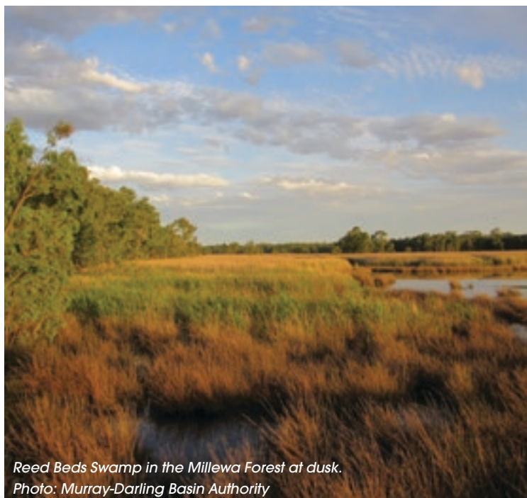
Reed Beds Swamp in the Millewa Forest at dusk.