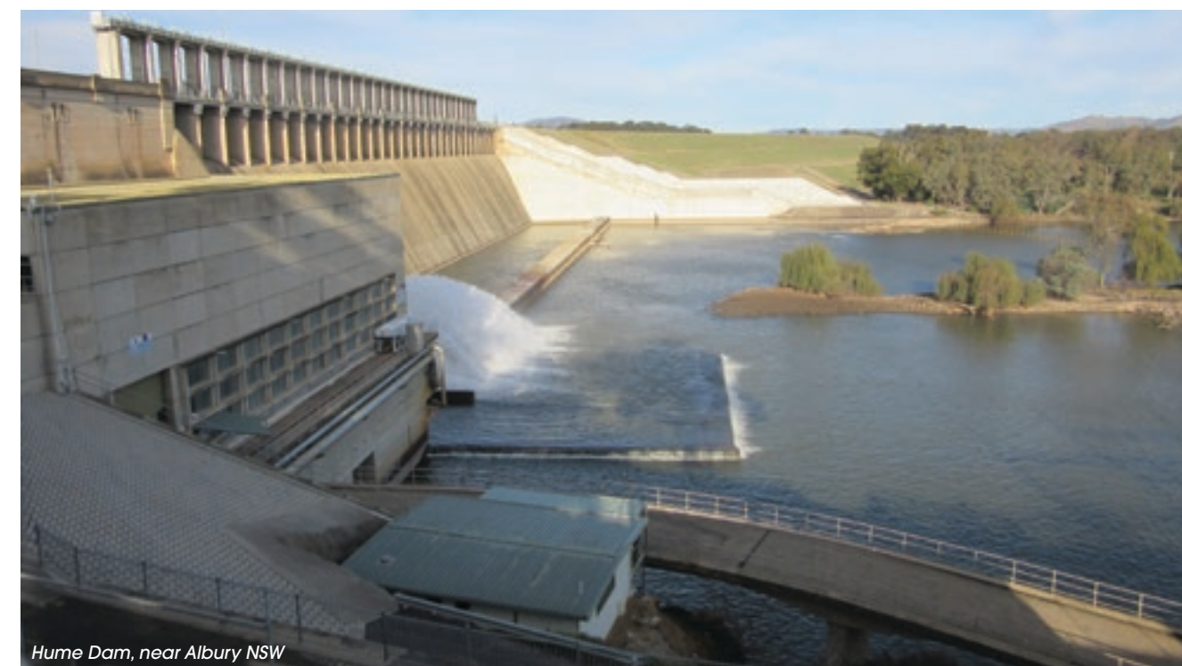
Hume Dam, near Albury NSW

Central Murray off-channel wetlands and ephemeral creeks - Hume to Euston: It is anticipated that the demands of native fish and vegetation of the permanent and semi-permanent wetlands will be met by a number of water holders in 2016-17. Commonwealth environmental water may be provided to several wetlands, consistent with local planning processes managed by state delivery partners. For example, up to 90 ML of Commonwealth environmental water has been made available for refilling Norman's Lagoon,