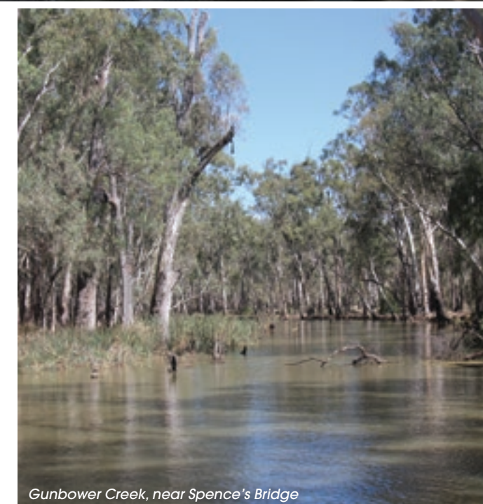
Gunbower Creek, near Spence's Bridge

Further information on our planning process and for a copy of the Portfolio Management Plan for the Mid-Murray region 2016-17 visit www.environment.gov.au/water/cewo