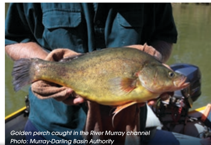
Golden perch caught in the River Murray channel

Create the right water conditions to improve native fish condition and spawning, movement between areas, and improve the age ranges and health of their communities.