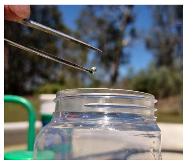
One of hundreds of native perch eggs recently detected in the lower Murray (jelly-like ball above jar)

Blanchetown, SA). This monitoring is led by the South Australian Research and Development Institute (SARDI).