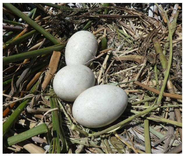
Australian white ibis eggs in the Barmah Forest, Keith Ward

Recent bird surveys in the Boals Deadwood—a wetland in Barmah Forest (Victoria)—have recorded signs of colonial waterbirds starting to breed. Over 300 birds—mostly Australian white ibis with strawnecked ibis and few royal spoonbills—have been spotted. Site managers are hopeful of a bird breeding event this year as it's been four years since colonial-nesting waterbirds last bred successfully in Barmah Forest.