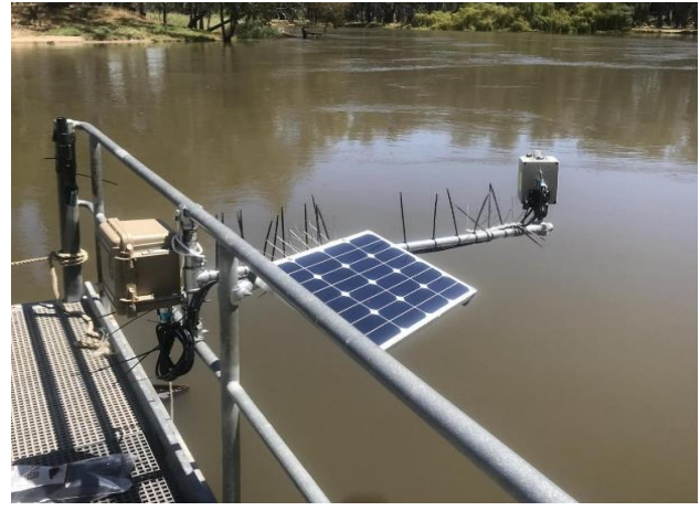
Water quality camera (HydraSpectra) deployed at, Barmah on the River Murray, Victoria.

Researchers are also trialling HydraSpectra cameras, a new technology that measures water quality in real-time. Data collected will help to show how river conditions change over time and between locations. This information will help river managers to make decisions about the use of different types of flows to improve water quality.