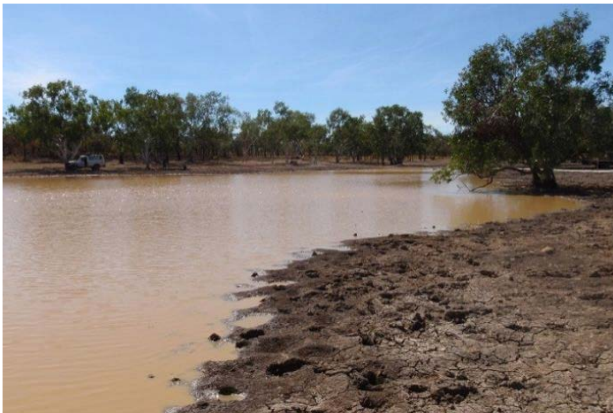
Figure 6a. Nalawan Lagoon, western Cape York, Queensland, in 2009, severely degraded by feral pigs.