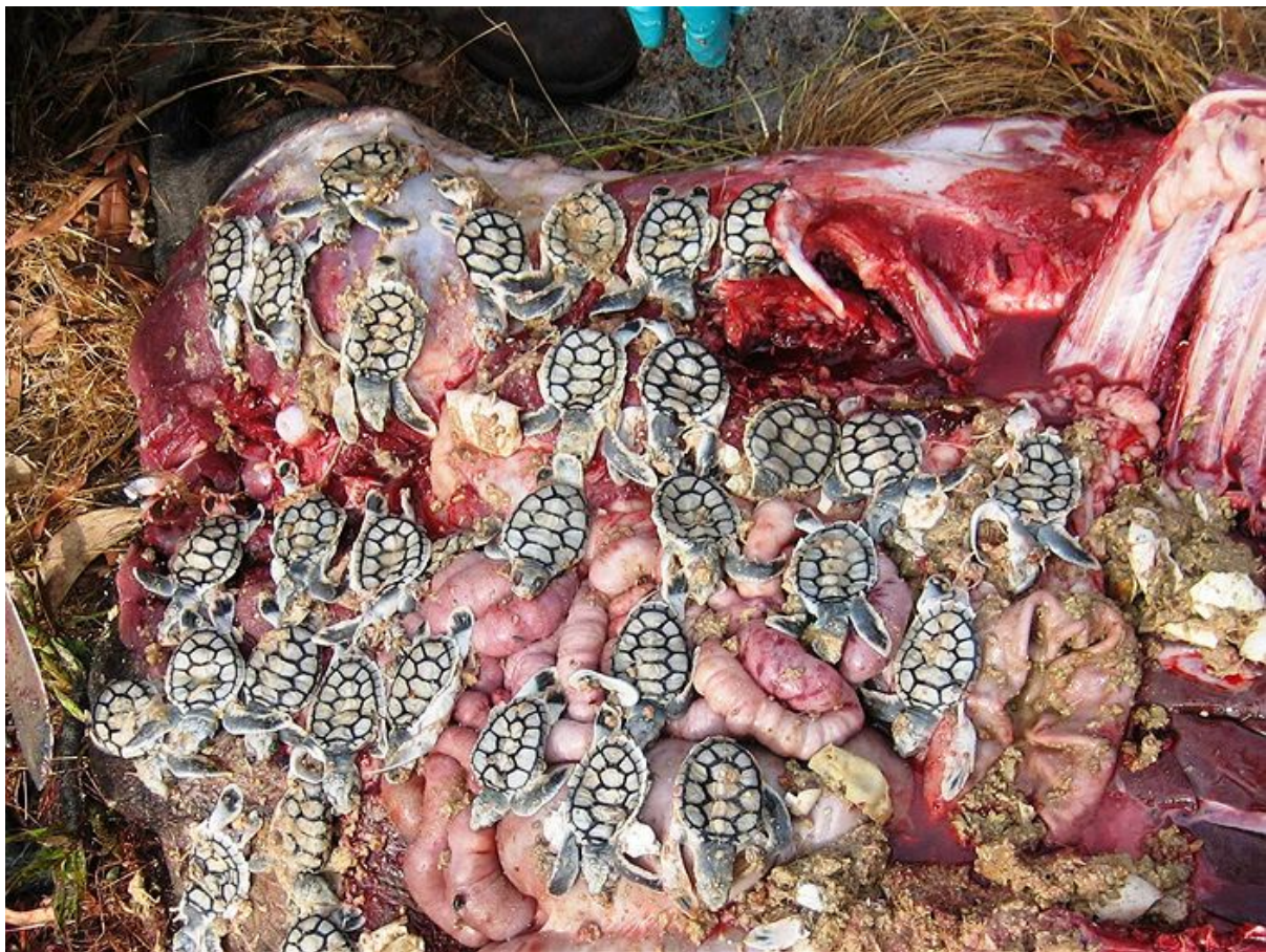
Figure 4. Photo showing an autopsy of a feral pig that had been preying on marine turtle hatchlings in north Queensland. The photo shows at least 32 hatchlings from one feral pig.

A study on Pennefather Beach in western Cape York found that overall turtle nest mortality (flatback, olive ridley and hawksbill turtles) was 42%, and that feral pig predation was responsible for 89.6% of this mortality (Whytlaw et al., 2013). Previous studies on the same beach have recorded even higher turtle nest mortality rates of 65% and 70%, mostly due to feral pigs (Whytlaw et al., 2013). This study found that most turtle nest predation was the work of a small number of individual feral pigs specialising in turtle nest predation, rather than the work of the broader feral pig population. Consequently, this predation was far more effectively controlled by targeting individual “specialist” feral pigs with shooting and baiting on beaches during the turtle nesting season, rather than through the broader aerial mass shooting strategy currently used, which aims to reduce the general population feral pig population in the region (Whytlaw et al., 2013).