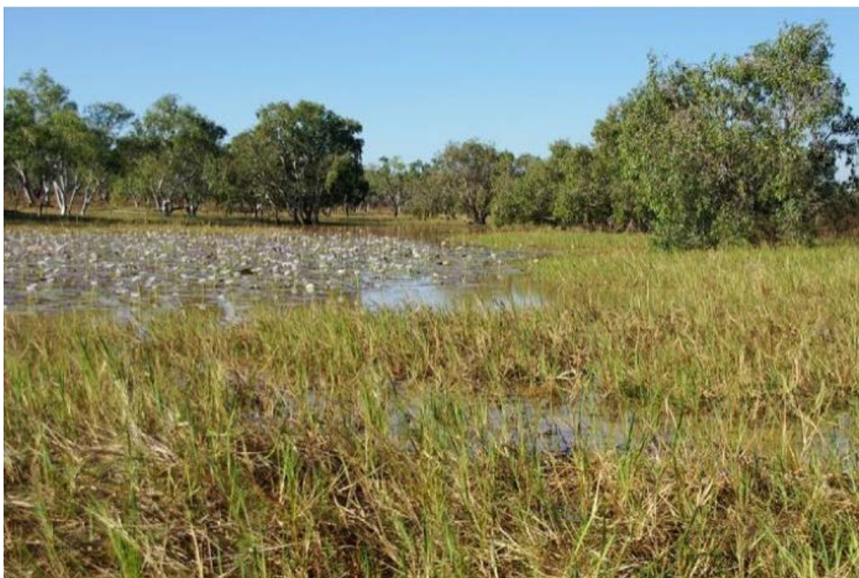
Figure 6b. Nalawan Lagoon in 2012, reverting to its natural state after feral pigs were excluded from it with fencing.