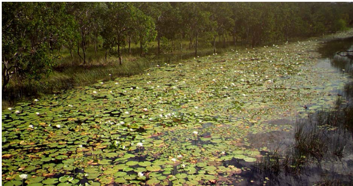
Figure 5a. A lagoon in the Archer River Basin, Cape York, Queensland, immediately after the end of the wet season. 15 May 2015.

On the Tiwi Islands, Northern Territory, there is widespread acknowledgement that feral pigs damage freshwater stream beds and banks as they search for freshwater mussels. As well as direct damage to the banks, the digging by the feral pigs causes turbidity of the waters.