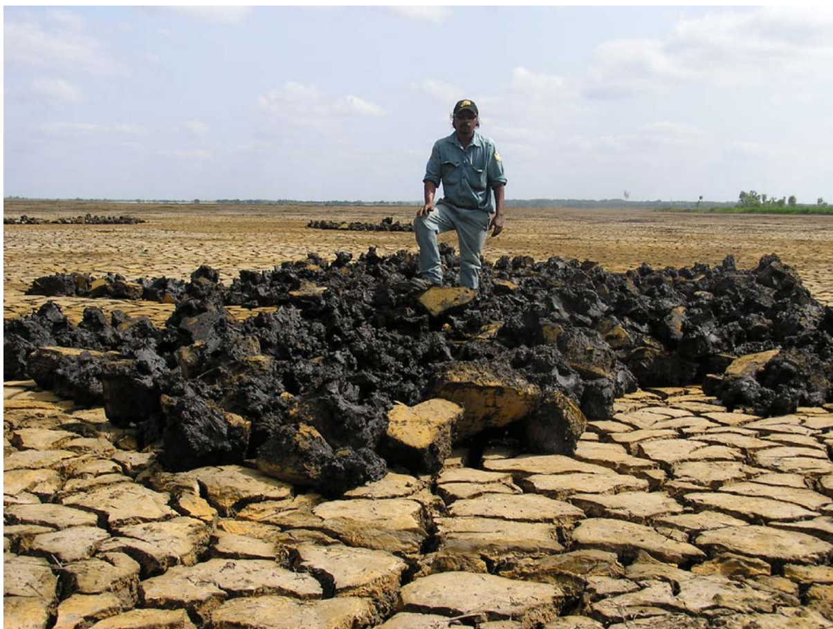
Figure 3. Feral pig diggings on the floodplain of the South Alligator River, Northern Territory, in the dry season.

The Kowanyama community (Mitchell River delta, western Cape York) report that freshwater turtles are no longer found at popular harvesting sites due to feral pig predation, and Yolngu people (north-east Arnhem Land) and Thamarrur (Wadeye, Northern Territory) rangers report definite impacts on freshwater turtles as well. The Carpentaria Land Council's Ranger Coordinator noted that the more severe impacts occur in drier years when water levels are lower.