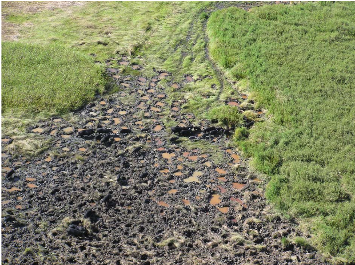
Figure 2. Aerial photo of feral pig damage on the East Alligator River floodplain, Northern Territory.

freshwater turtles and frogs. In coastal areas, feral pigs are major predators of eggs and hatchlings from marine turtle nests.