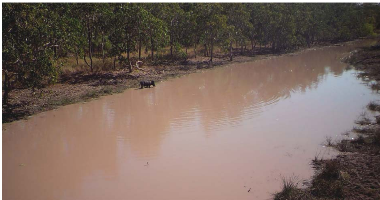
Figure 5b. The same lagoon seriously degraded by feral pigs only two months into the dry season. Note the now-bare banks, turbid water and complete lack of aquatic vegetation. 25 July 2015.