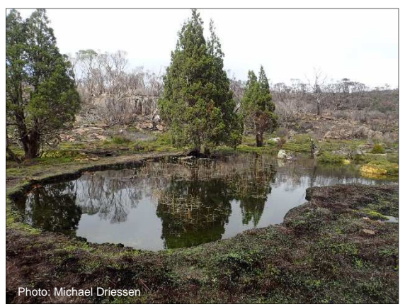
Subalpine vegetation near Lake Mackenzie 13 months after the January 2016 fires