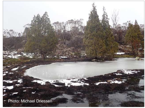
Subalpine vegetation near Lake Mackenzie four months after the January 2016 fires

The Tasmanian Government has undertaken extensive assessment and monitoring in key areas affected by the fires. This includes the alpine area around Lake Mackenzie and the Mersey Forest area. While some areas remain susceptible to ongoing erosion, high altitude grassland, sedgelands and some cushion plant communities are recovering well. The following photos illustrate recovery of subalpine vegetation near Lake Mackenzie.