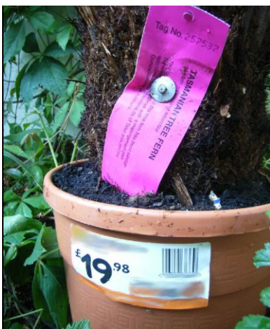
Tasmanian Dicksonia for sale in the United Kingdom