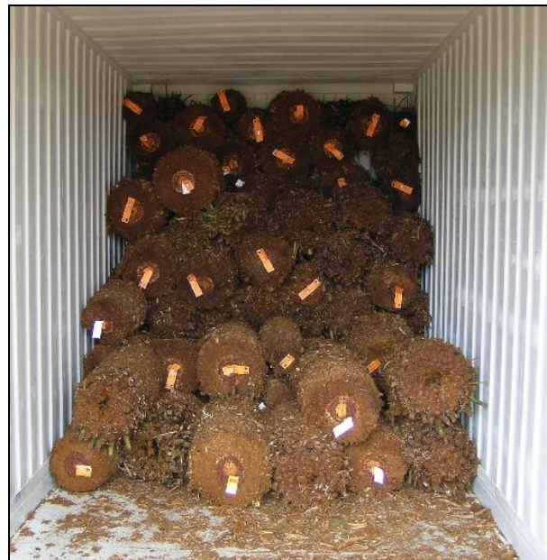
Dicksonia tagged and packed into a refrigerated container ready for export. Note: Some tags are not visible due to stacking.