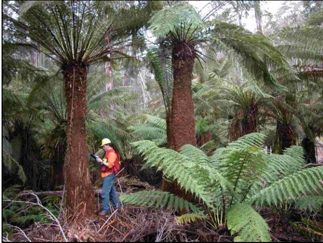
Tall Dicksonia growing in Southern Tasmania