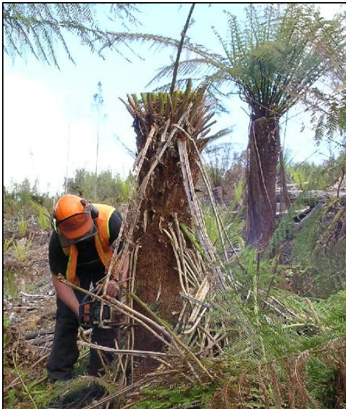
Live Dicksonia being harvested