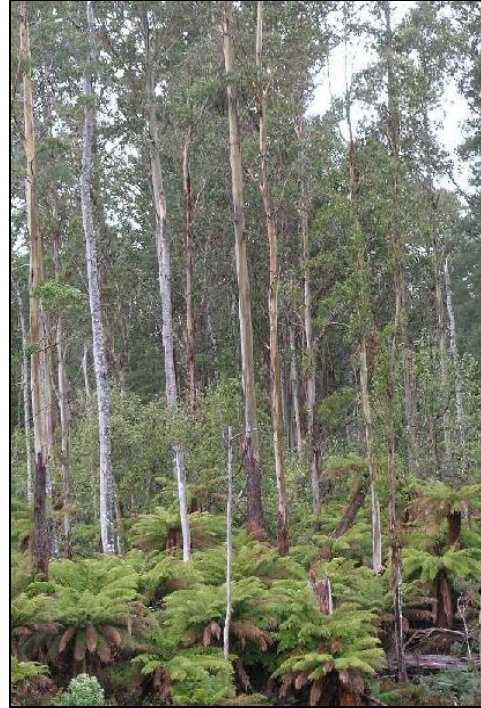
Tall wet eucalypt forest with a dense Dicksonia understorey