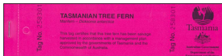
Tasmanian Tree Fern Tag number 258301