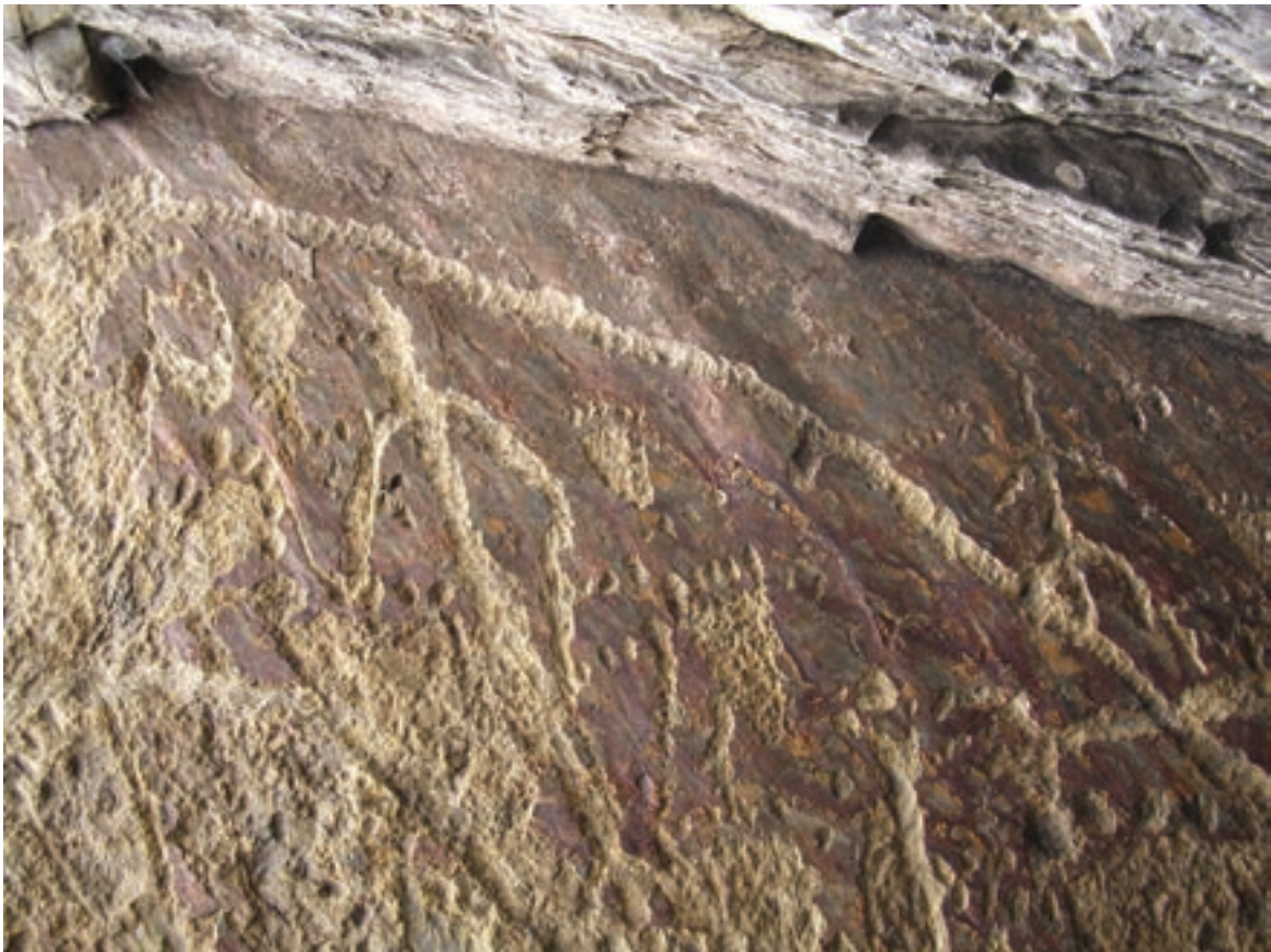
Human and Wallaby tracks adorn an Aboriginal rock shelter in South West Tasmania

The relevant Tasmanian law is the Aboriginal Relics Act 1975 (Tas). Under the Act, it is illegal to “destroy, damage, deface, conceal, or otherwise interfere with a relic”. Cultural sites are also protected under Tasmania's National Parks and Reserves Management Act 2002 and National Parks and Reserved Land Regulations 2009 , which provide for the care, control, preservation and protection of National Parks and reserves. In particular, the National Parks and Reserved Land Regulations 2009 provide comprehensive protection for reserved land and prohibit removing, damaging, defacing or disturbing any Aboriginal relic or any object of archaeological interest.