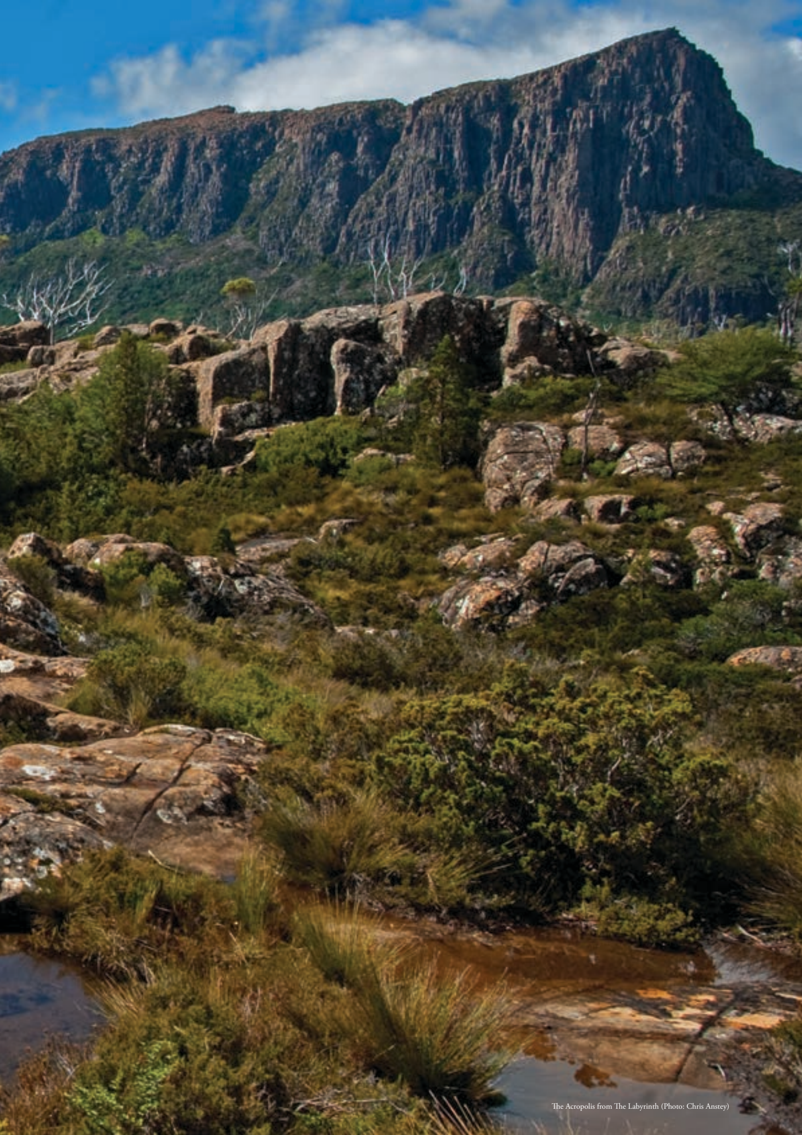
The Acropolis from The Labyrinth