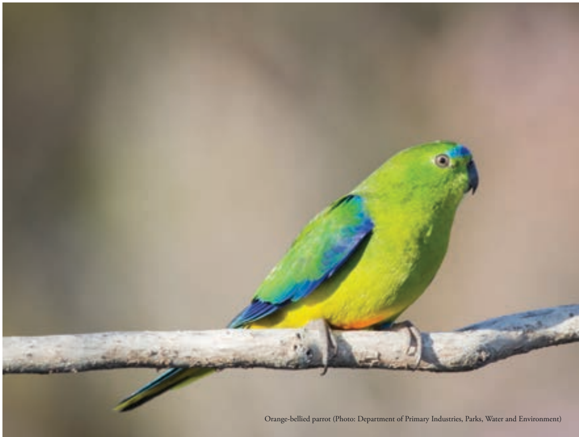
Orange-bellied parrot

A captive insurance population is another important element in the recovery programme for this species. Releases of captive bred birds into the wild are seen as critical actions to promote long-term survival in the wild. In the 2013-14 breeding season 24 captive bred birds were released at Melaleuca. A number of these birds successfully bred and fledged chicks, augmenting the 2013-14 breeding productivity of the species. Importantly, a number of captive-bred and released adults and their wild-fledged offspring returned to the Melaleuca breeding site at the start of the 2014-15 breeding season, almost doubling the numbers of Orange-bellied parrots returning to Melaleuca to breed. A translocation of 27 birds has recently been conducted at Melaleuca in the 2014-15 breeding season. Further translocations will be considered for coming breeding seasons.