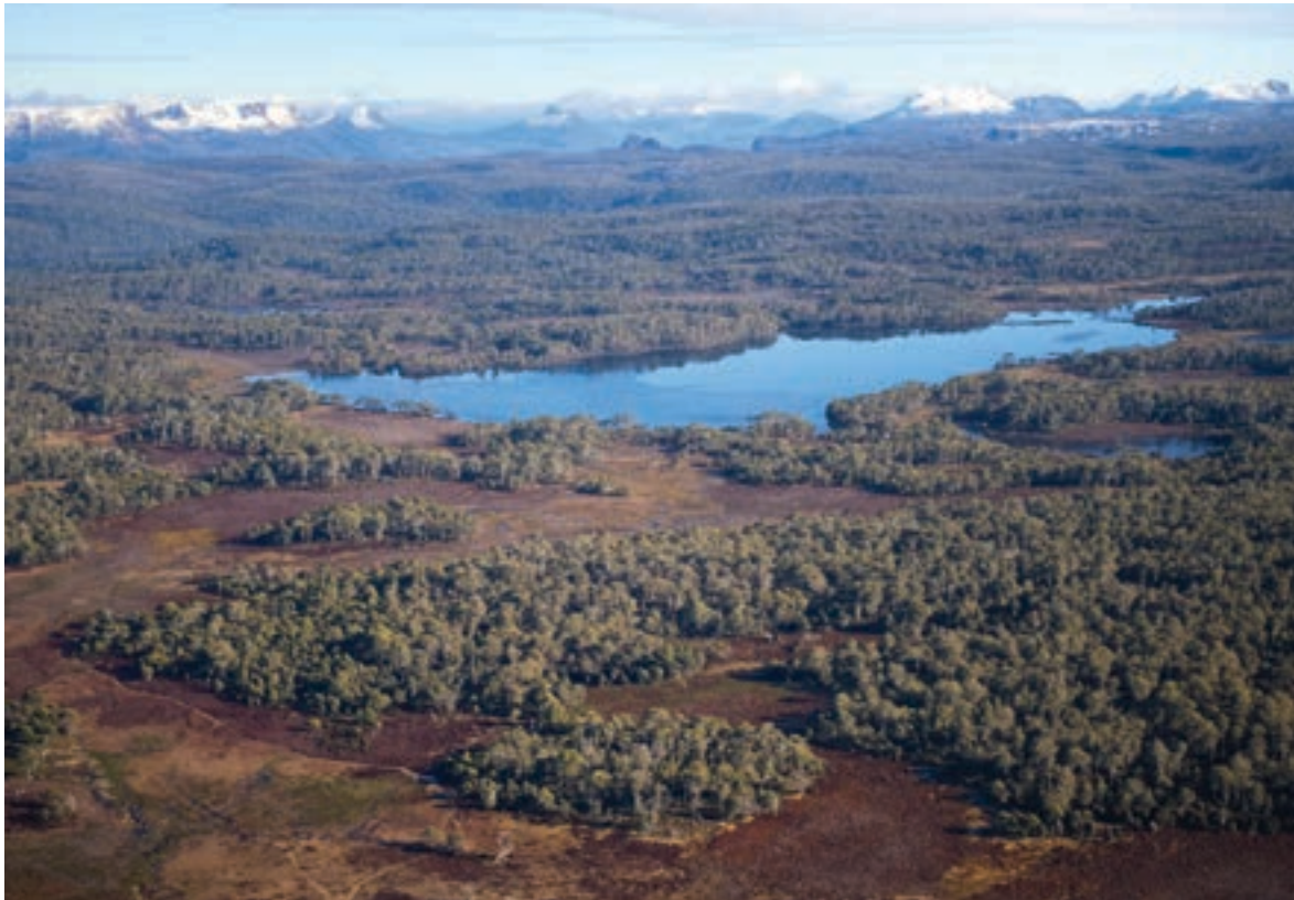
Skullbone Plains

There are no known cultural heritage sites on the Liffey Reserve however no formal surveys have been undertaken. The existence of sites with local heritage value remains a possibility as the Liffey area has a long history of European and Aboriginal use.