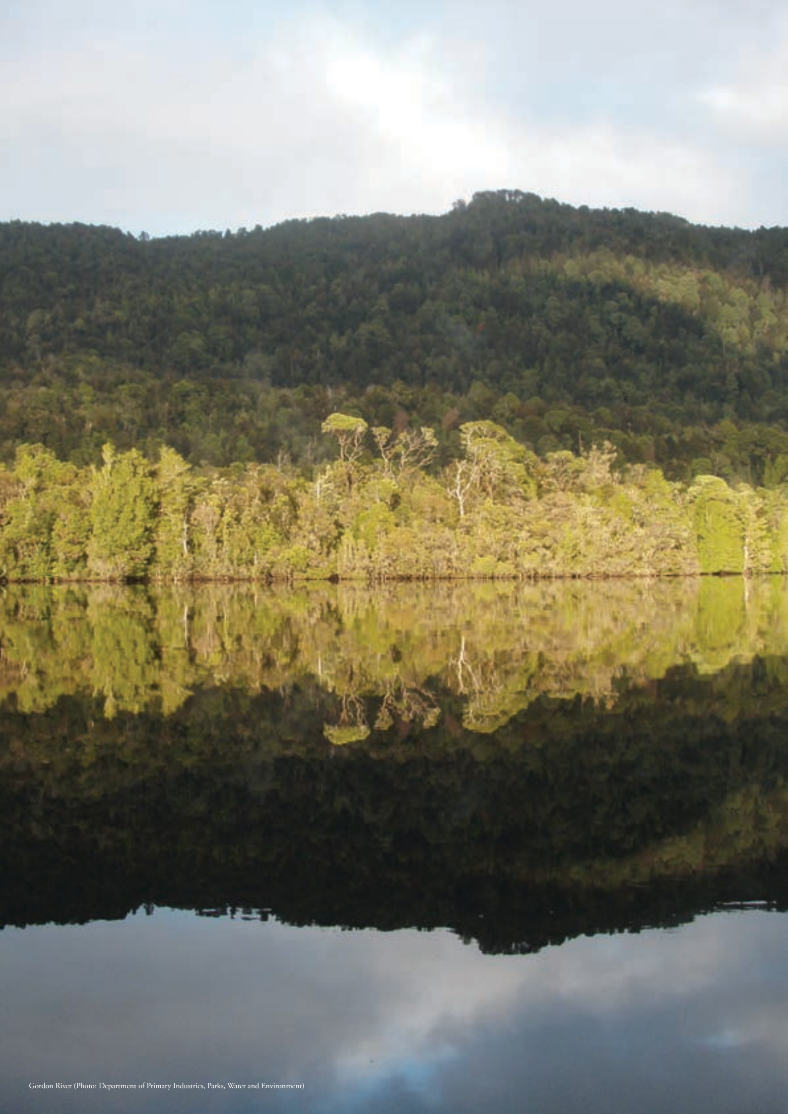
Gordon River