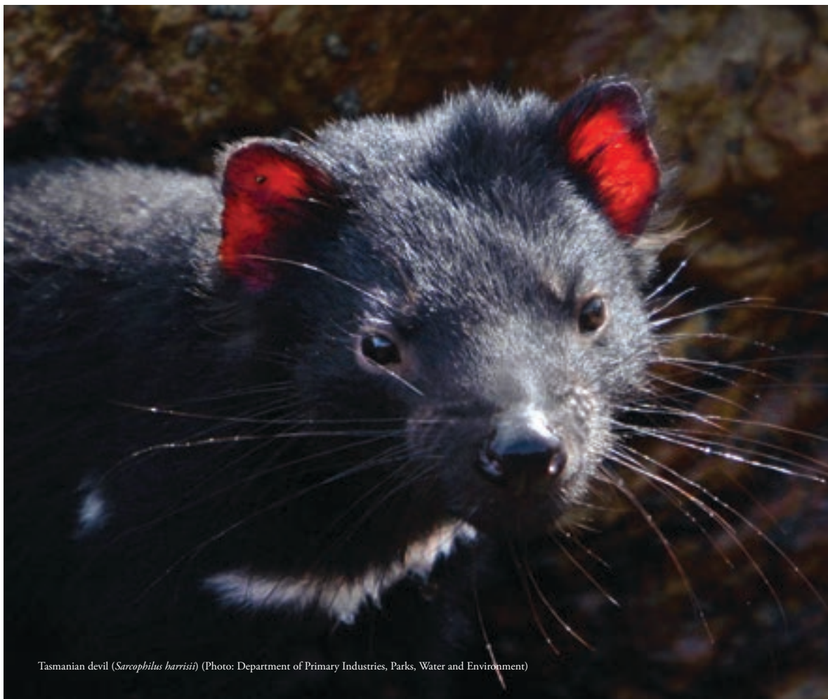
Tasmanian devil ( Sarcophilus harrisi )

The Australian Government committed $A3.3 million in project funding in 2014 and the Tasmanian Government is providing $A2.3 million annually to the Save the Tasmanian Devil Program. Through the implementation of a diverse range of research and management actions, considerable progress has been made