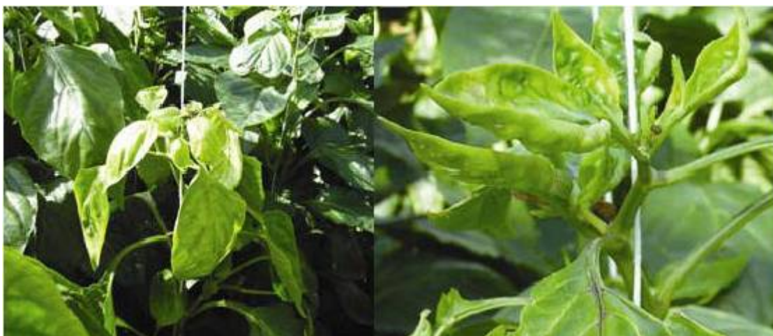
Figure 4.2: Symptoms of psyllid yellows in capsicum plants (Liefting et al. 2009)