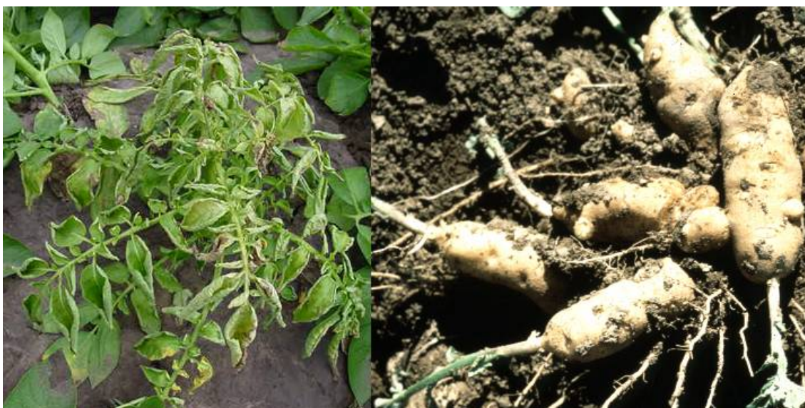
Figure 4.3: Foliar scorching and premature tuber sprouting symptoms of psyllid yellows in potato plants (Secor 2006; Cranshaw 2004)

Leaf scorching and premature sprouting symptoms of psyllid yellows are shown in Figure 4.3.