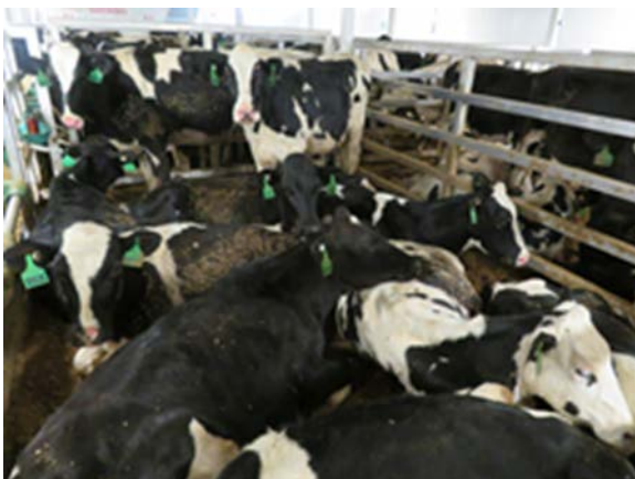
Day 14 Cattle in pen - no issues identified