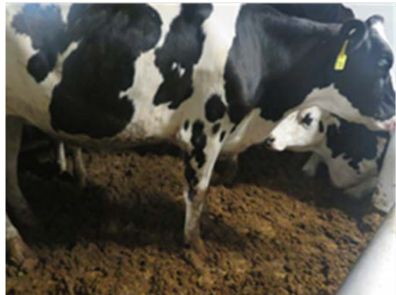
Day 6 Cattle in pen - no issues identified