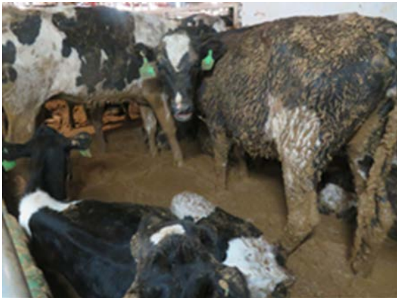
Day 6 Cattle in pen – wet pad conditions