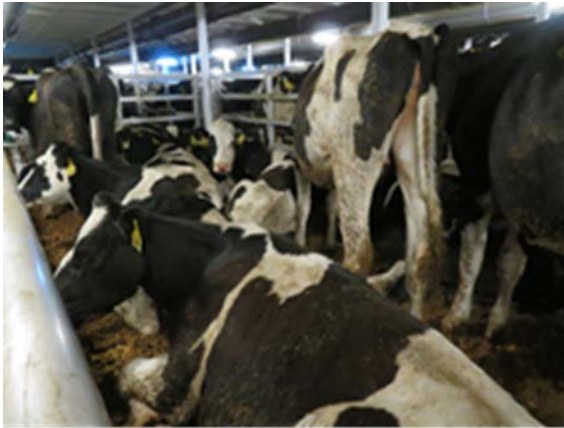
Day 4 Cattle in pen - no issues identified