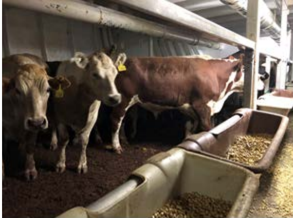
Day 2 Cattle in pen — no issues identified