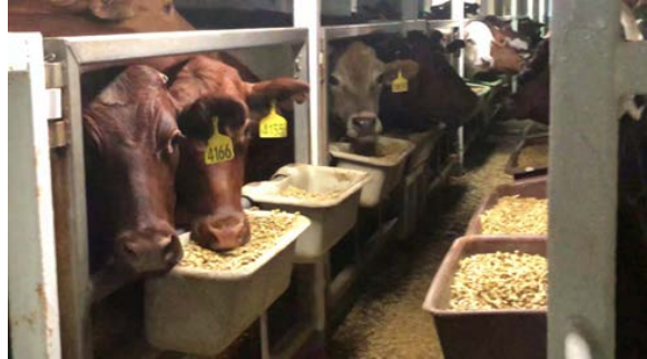
Day 10 Cattle in pen — no issues identified