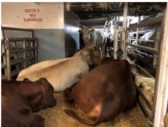
Day 19 Cattle in pen — no issues identified