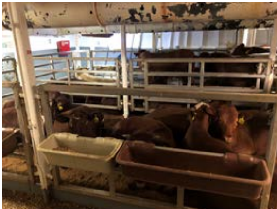
Day 13 Cattle in pen — no issues identified