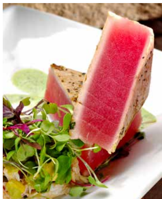
Tuna on plate