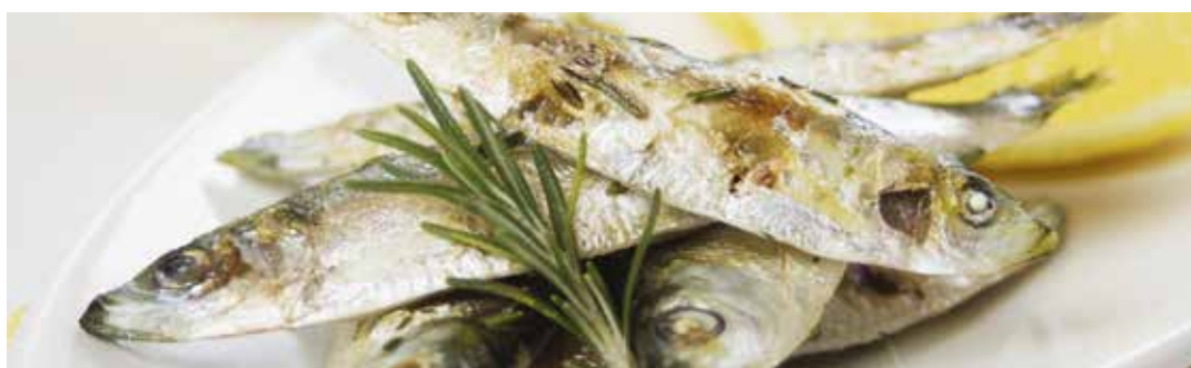
Sardines on plate

The Australian Government will pursue the sustainable use of shared domestic stocks. The Australian Government will seek an equitable allocation of catch and management costs for Commonwealth fishers in negotiations with other jurisdictions that share in the management of a stock. The government will consider all available mechanisms, including revisiting Offshore Constitutional Settlement arrangements and Commonwealth fisheries legislation to ensure these objectives are met. The Australian Government will also cooperate with state and territory jurisdictions in rebuilding overfished stocks that are harvested in Commonwealth fisheries.