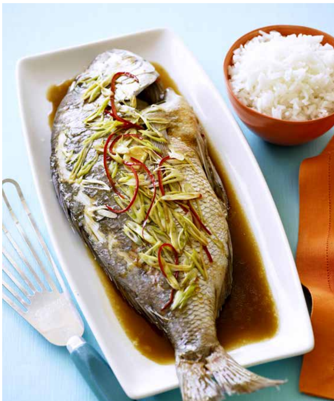
Plated white fish

For a stock assessed as below the biomass limit reference point (that is, overfished), targeted fishing must cease and a stock rebuilding strategy developed to rebuild the stock to above the limit biomass level (see Section 3.13 on rebuilding overfished stocks).