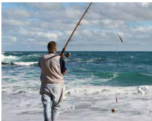
Recreational fisher

Harvest strategies should also account for all known non-fishing related sources of mortality that cannot be managed or constrained by AFMA.