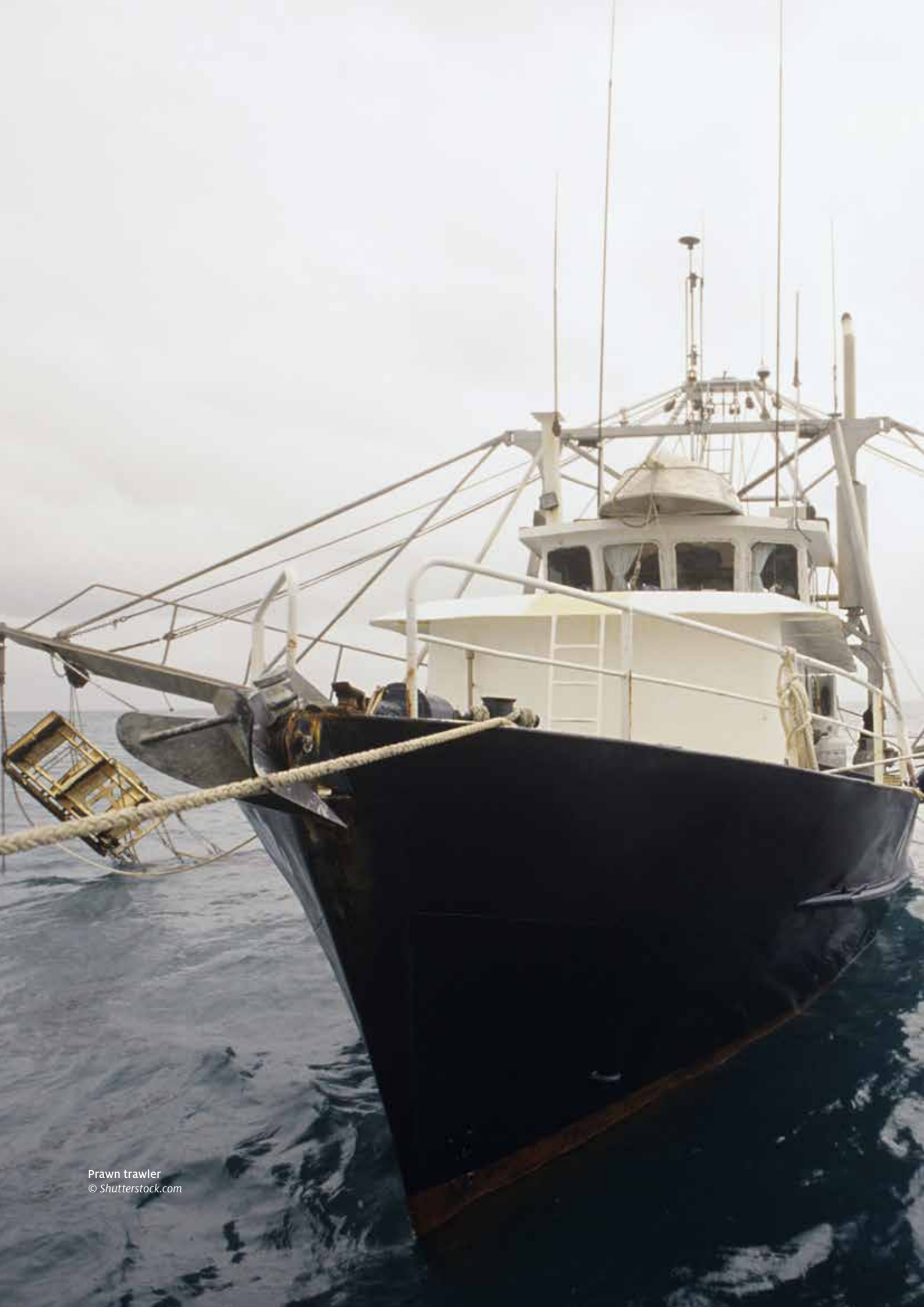
Prawn trawler