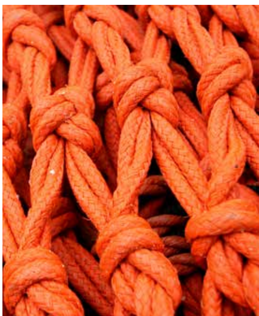
Net