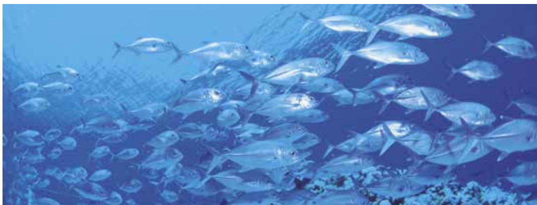
Trevally school

If a species is listed in any of the vulnerable, endangered or critically endangered categories, it is then considered an EPBC Act-listed species and is managed in Commonwealth fisheries under the Bycatch Policy and the Environment Protection and Biodiversity Conservation Act 1999 , as appropriate.