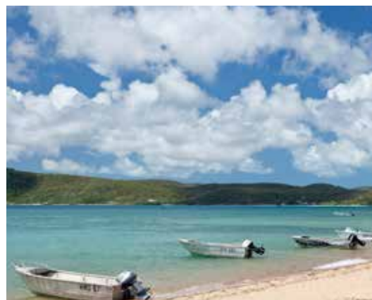
Thursday Island boats