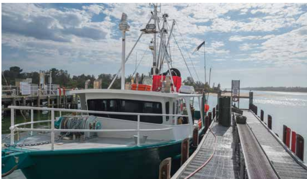
Boat at dock

Technical evaluation is particularly important when information is incomplete or imprecise and when the relationship between the harvest control rule and fisheries specific objectives or management outcomes is complex.