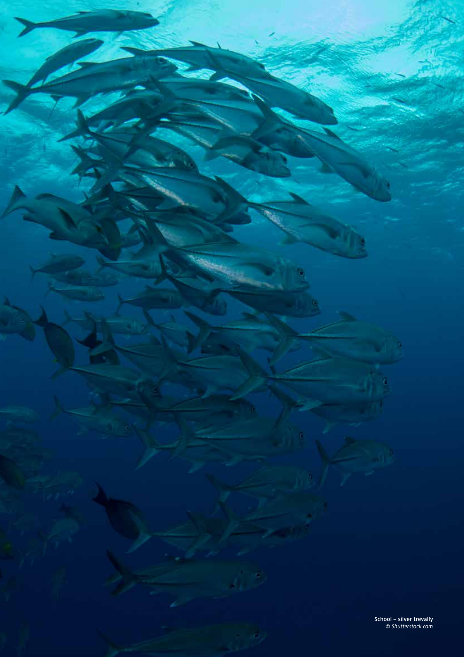
School - silver trevally