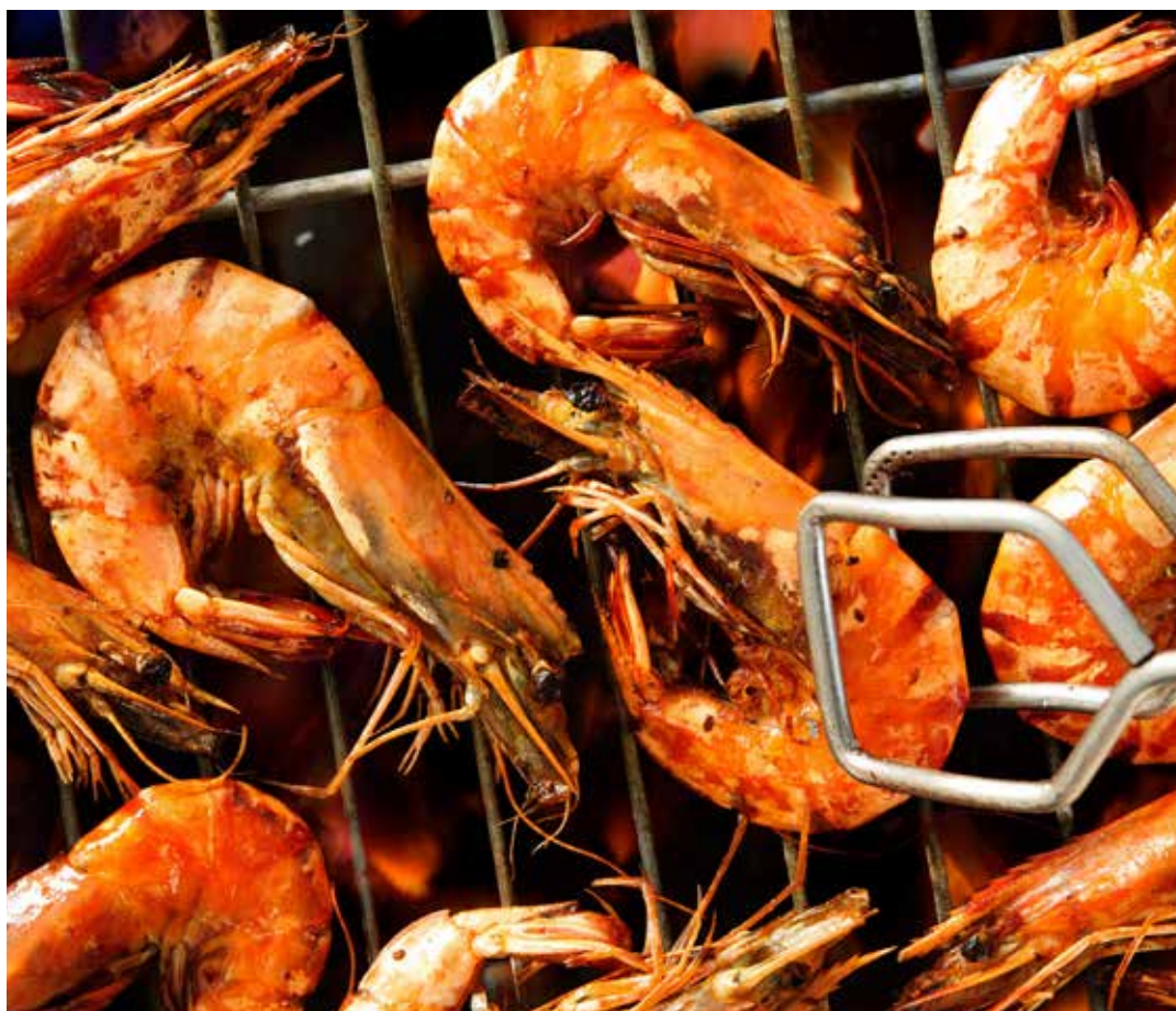
Prawns on barbeque

Implementing harvest strategies by themselves will not necessarily achieve ecologically sustainable or economically optimal fisheries. Other tools are available to Commonwealth fisheries managers, including the Australian Government’s ecological risk assessment and ecological risk management framework, and bycatch management under the Bycatch Policy. Harvest strategies in combination with the other elements of the Commonwealth fisheries management system constitute a comprehensive approach to ecosystem-based fisheries management. In some cases cooperation will be required with other jurisdictions in the management of shared resources to ensure objectives can be met for Commonwealth fisheries.