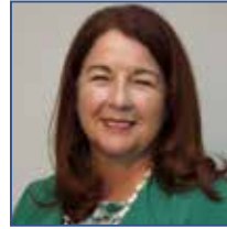
Senator the Hon. Richard Colbeck Assistant Minister for Agriculture and Water Resources

A handwritten signature in blue ink that reads "Melissa Price".