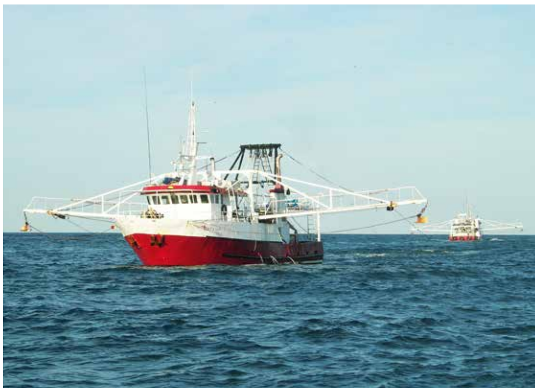
Prawn trawlers at sea

Significantly, under legislation the exploitation of Commonwealth fisheries resources and related activities must be conducted in a manner consistent with the principles of ecologically sustainable development. This includes exercising the precautionary principle and considering the impact of fishing activities on non-target species and the long-term sustainability of the marine environment.