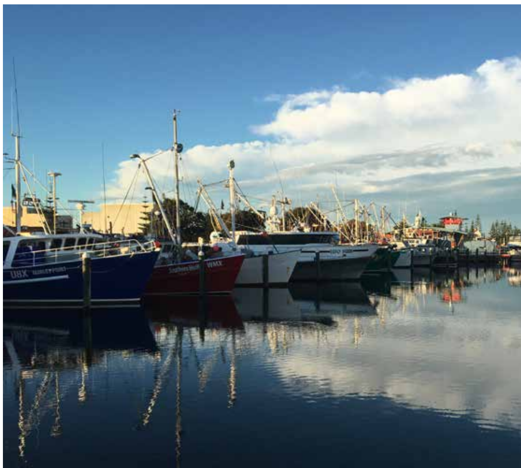
Boats at Lakes Entrance