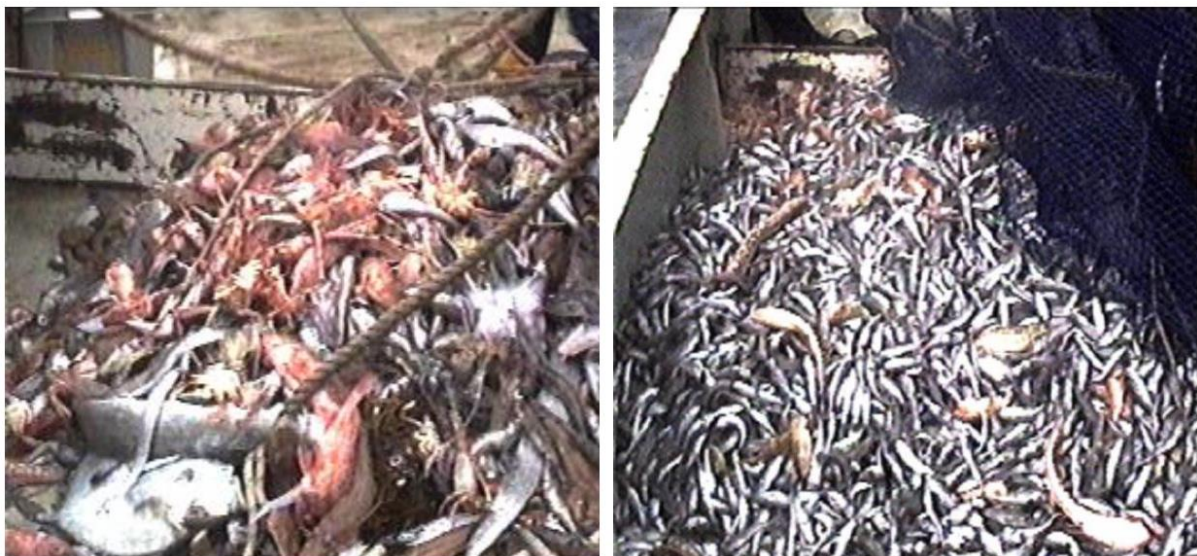
Photographs of the catch from the codend (left) and the catch that escaped through the codend into the cover (right).