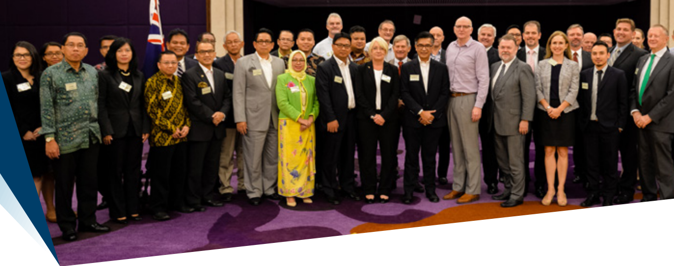
▲ Partnership Members at the fourth Partnership meeting, 27 April 2016