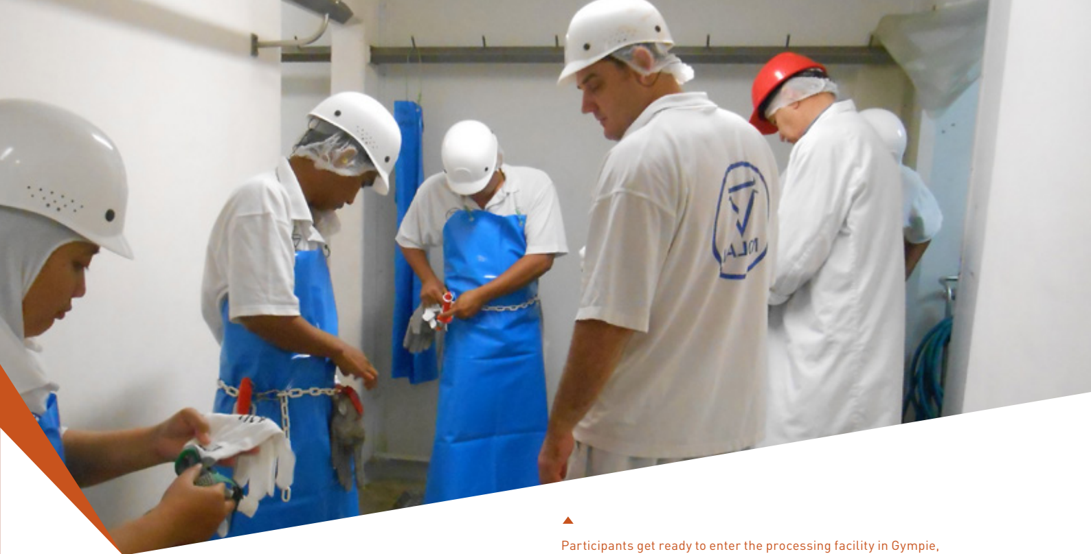
▲ Participants get ready to enter the processing facility in Gympie