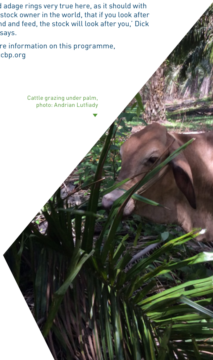
Cattle grazing under palm

For more information on this programme, visit iaccbp.org