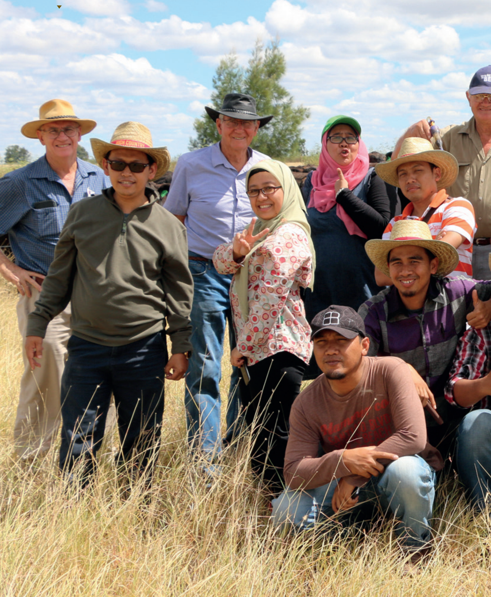
Junior policy awardees visiting a wagyu cattle farm, University of Queensland